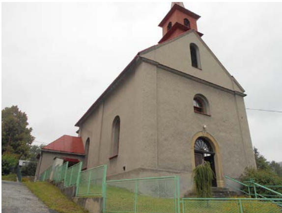
St. Mary Magdalene Chapel, Mniší