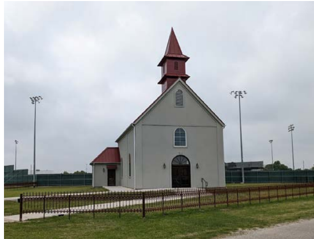
St. Mary Magdalene Chapel, La Grange